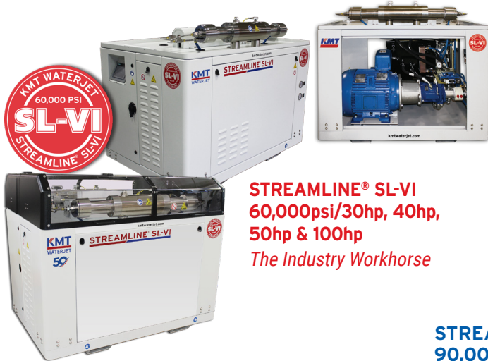
STREAMLINE® SL-VI 60,000psi/30hp, 40hp, 50hp & 100hp The Industry Workhorse

KMT STREAMLINE® SL-VI pumps deliver the necessary power, productivity & performance based on your requirements ranging from 15hp-200hp & from 60,000psi to the STREAMLINE PRO® 90,000psi/125hp---World's Fastest Waterjet!