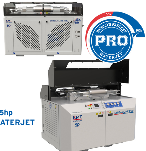
STREAMLINE PRO® III 90,000psi/60hp & 125hp WORLD'S FASTEST WATERJET